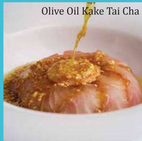
Olive Oil Kake Tai Cha