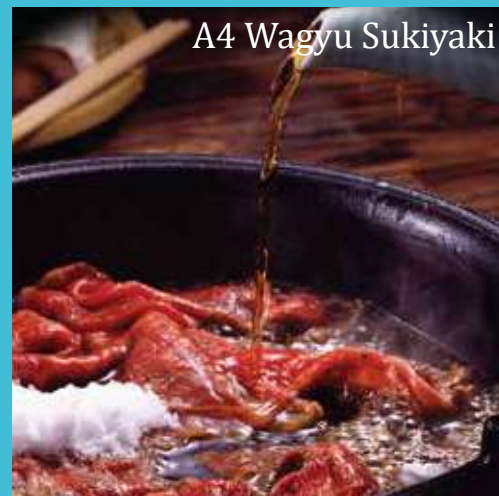
A4 Wagyu Sukiyaki

MEAL PLAN GUESTS CAN ENJOY THE ABOVE FOR AN ADDITIONAL $45** SUPPLEMENT PER PERSON